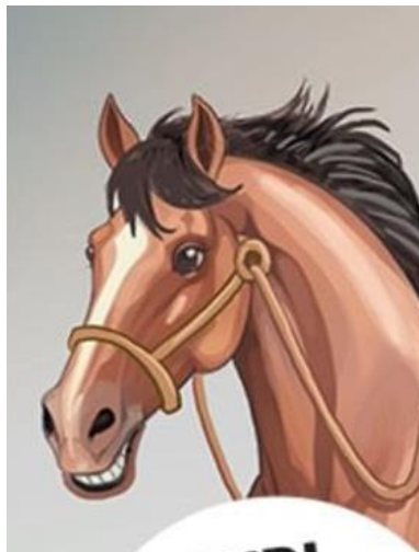
Figure 3. visual icon of horses

As for the visual horse here can be interpreted in denotation as a pet that is easily controlled by the master. Its connotation means strength, endurance, or may refer to certain political symbols associated with the horse element. Horses can also be interpreted as a mount that can lead to power. This is also interpreted as a container of the Coalition of Advanced Indonesia (KIM).