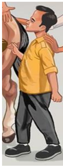
Figure 5. Visual icon of Gibran Rakabuming Raka

candidate for political contestation for a presidential candidate. The meaning of clean white clothes is a sign of state officials who currently have power and authority. White can also be interpreted as purity, pure, and classic. Prabowo's hand is denotated as a form of help (as above). While the meaning connotatedly shows Prabowo's attempt to hook Gibran as a pair of candidates 2024.