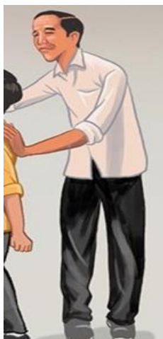
Figure 6. Visual icon of Jokowi

The visual Jokowi interpreted in denotation is the father of the President of the Republic of Indonesia who still serves until now or public official figures. Connotation is interpreted as a public official who is involved in the phenomenon of cawe-cawe against one of the presidential and vice presidential candidates. It shows the negative things attached to Jokowi as the head of state that should focus on political neutrality let alone still serve as president. The color of Jokowi's clothes is interpreted as purity, neutrality, and clean. The position of Jokowi's hand as if to put pressure or push Gibran towards Prabowo. This is interpreted as an effort to give way to Gibran to become a prabowo couple in the upcoming election.