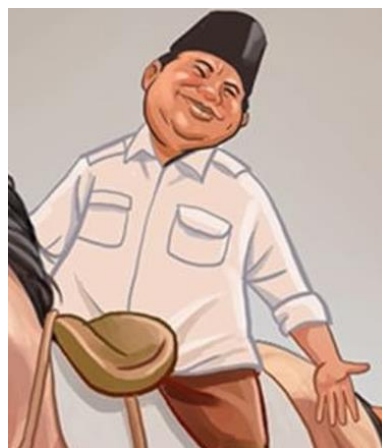
Figure 4. Visual icon of Prabowo

As for the visual horse here can be interpreted in denotation as a pet that is easily controlled by the master. Its connotation means strength, endurance, or may refer to certain political symbols associated with the horse element. Horses can also be interpreted as a mount that can lead to power. This is also interpreted as a container of the Coalition of Advanced Indonesia (KIM).