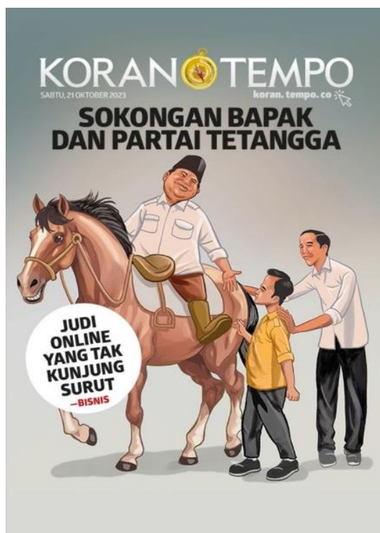
Figure 2. Cover of Koran Tempo October 2023 edition

Caricature titled “Sokongan Bapak Partai Tetangga” describes how the efforts and attitudes of Prabowo, Jokowi, and Gibran Rakabuming Raka towards the hot seat of the 2024 presidential and vice presidential candidates. Although in the form of a caricature, this image is a communication message that is a reflection of the attitude of the Tempo media. Meanwhile, in this caricature there is an object as follows: