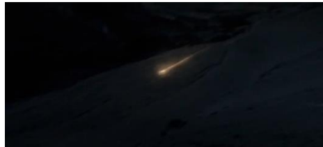
Figure 13. A figure when Makkari runs

Furthermore, concerning Makkari's speed powers, it ironically makes her unseen and isolated. While the other Eternals are clearly visible figures when they are in action, with Makkari's actions, only a streak is visible, creating the impression of a human figure that exists but seems nonexistent, as depicted in Figure 13.