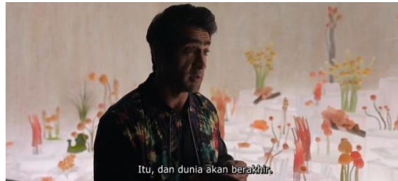
Figure 7. Kingo talks all the events happened to Makkari

as teasing in a negative sense. In each scene involving Druig and Makkari, although it is narrated in The Eternals that they are mutually interested, Druig tends to tease Makkari, making her blush, which further reinforces the impression that Druig is just playing with her. In my opinion, if Druig is genuinely interested and pays more attention to Makkari, why, during the scene where Makkari is about to be attacked by Ikaris, is she rescued by Kingo and not by Druig?