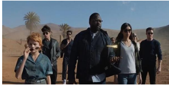
Figure 2. When The Eternals come to Makkari on present-day

Not only that, during the present-day appearances in the Eternals story, Makkari is the last one to be approached when many events have occurred, where even Kingo's assistant, who is not part of The Eternals, appears more frequently in scenes than Makkari. This is because Kingo is the first person encountered after Ikaris meets Sersi and Sprite. This fact further strengthens my belief that Makkari experiences objectification.