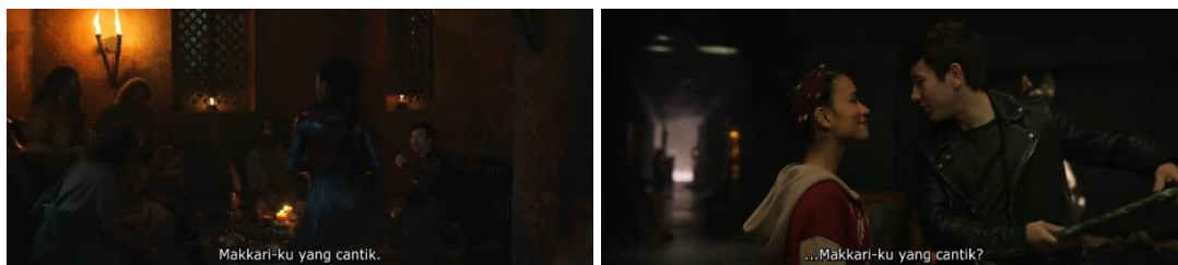
Figure 6. Druig teases Makkari

In that scene, it gives the impression that Makkari might be deceived because she seems unable to see or is visually impaired, not mute, not visually impaired. This creates an impression that once someone has a limitation, it will generate stigma that they might have other limitations as well. Furthermore, the scene also seems to indicate that when Makkari attempts to blend in and interact with people around her, those individuals, on the contrary, will underestimate her and take advantage of her disability.