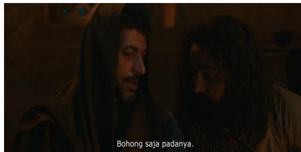
Figure 5. People Babilon intended to deceive Makkari

The next finding is that disabilities are looked down upon by people around them. This impression arises in Babylon when Makkari approaches a group of men where Druig, an Eternal with the power of mind control, is also present. When Makkari arrives, most of the men leave, and those remaining intend to deceive Makkari, as seen in Figure 5.