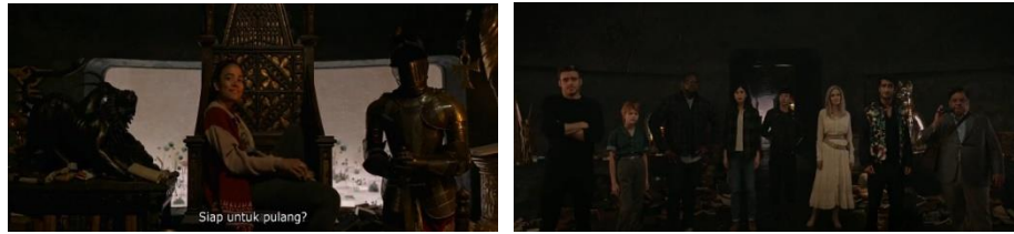
Figure 9. First appearance of Makkari and The Eternals on present-day.

from Kingo and Makkari to Druig and Ikaris, leaving only Kingo's voice explaining, making Makkari seemingly disappear because she is not presented visually or audibly due to her disability condition.