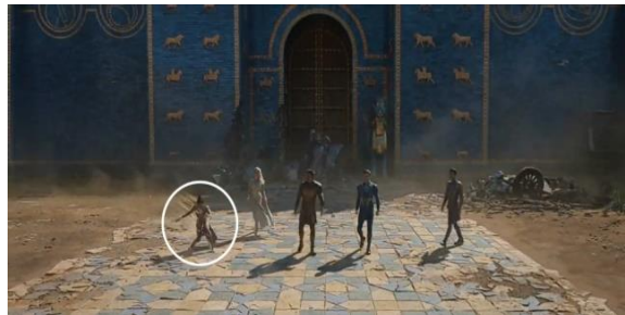
Figure 3. Makkari's last appearance in Babylon

In addition to Makkari being only a supporting character, I also got the impression that Makkari is an incompetent superhero. This impression arises when the film is set in Babylon, 575 years before Christ. It is because Makkari is a superhero with the power of speed, yet she is the last one to appear when they regroup, giving the impression that she is incompetent. Despite having super speed abilities, she tends to always be the last to appear, even ending up as the very last one, as seen in Figure 3.