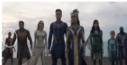
Figure 1. First appearance of Eternals on Earth

Based on the entire storyline, it is evident that Makkari, a character with a disability, is not part of the main characters. Although Makkari is a superhero within the Eternals, she remains a supporting character. This can be observed from the beginning of The Eternals when the Deviants attack Mesopotamia, 5000 years before Christ. In the initial narrative setting, Makkari is briefly introduced second after Ikaris while attempting to save a Mesopotamian boy, later praised by Kingo. With this early scene in the film, it seems to showcase that the movie Eternals includes a character who is mute as a representation for the disabled community. However, Makkari's appearance at the start of the story might be mere objectification, emphasizing the differentiation in superhero films by using a character with a disability, as Makkari is not a part of the main characters, implying that Makkari still remains part of the marginalized group..