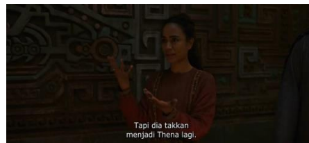
Figure 10. Makkari expresses opinion

Not only that, the impression of discrimination is even evident in scenes such as Figure 9, where all the Eternals approach Makkari as the last person approached in the present time. The Eternals are depicted lining up facing Makkari, who is alone, further indicating that Makkari is different from the others.