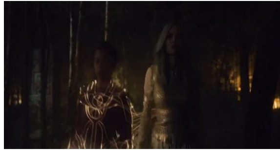
Figure 4. Makkari follows Thena in Tenochtitlan

The next finding is that disabilities are looked down upon by people around them. This impression arises in Babylon when Makkari approaches a group of men where Druig, an Eternal with the power of mind control, is also present. When Makkari arrives, most of the men leave, and those remaining intend to deceive Makkari, as seen in Figure 5.