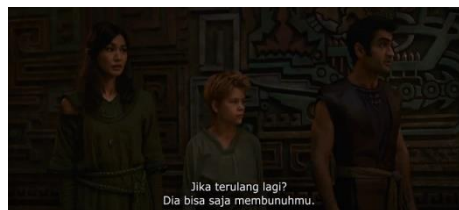
Figure 11. Kingo opposes Makkari's opinion.

Discrediting is also evident when Makkari expresses her view regarding Thena seemingly being possessed by something evil. She is immediately contradicted by Kingo, depicted alongside Sersi and Sprite, as seen in Figure 11. The three of their gazes seem uncomfortable and displeased when a person with a disability voices their opinion.