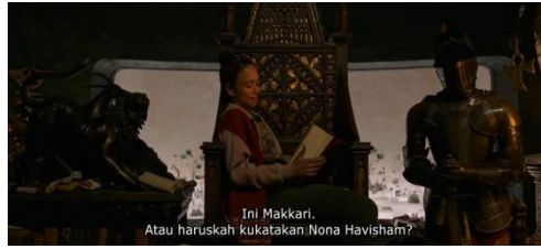
Figure 12. Makkari is reading when The Eternals come

As seen in Figure 12, where she confines herself inside the Domo, The Eternals' vehicle hidden in the sand, while others mingle with people on Earth. Not only does it give the impression of not enjoying socializing, but it also creates the perception that a person with a disability is a disgrace and thus needs to be concealed. Kingo's reference to "Miss Havisham" regarding Makkari, even if it is meant as a joke in the film, also leans towards something negative. This is because Miss Havisham is an antagonistic character portrayed as an old, sorrowful figure from Charles Dickens' novel "Great Expectations," repeatedly depicted as a vengeful woman, resembling a ghost in a decaying wedding dress (lithub.com).