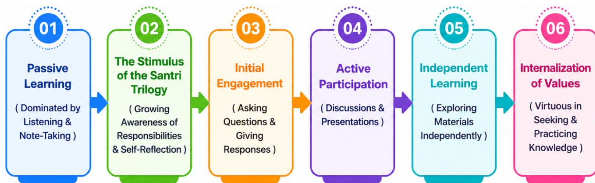
Figure 2. Diagram of the Paradigm Shift in Santri Learning

The following is a visual representation in the form of a flowchart compiled based on documentation, demonstrating a shift in the student learning paradigm from a passive to an active pattern. The diagram is designed following the hierarchical stages illustrated previously. The following description demonstrates the gradual and ongoing process of changing student learning behavior: